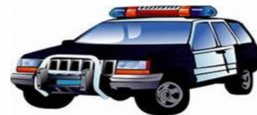
Security Sponsorship One officer $135.00

Sponsorships can be planned in Honor of a special occasion or in Memory of a Loved One Call the Temple office 501.225.9700 or email templesecretary@bnai-Israel.us to reserve your sponsorship date.