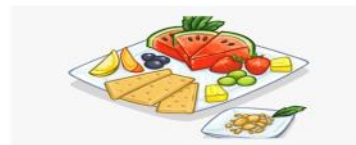
Oneg Shabbat Sponsorship $54.00