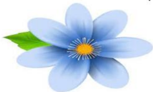
Bimah Flowers Sponsorship $100.00

We are reuniting at Temple for Friday Shabbat Services. Your sponsorship is greatly appreciated.